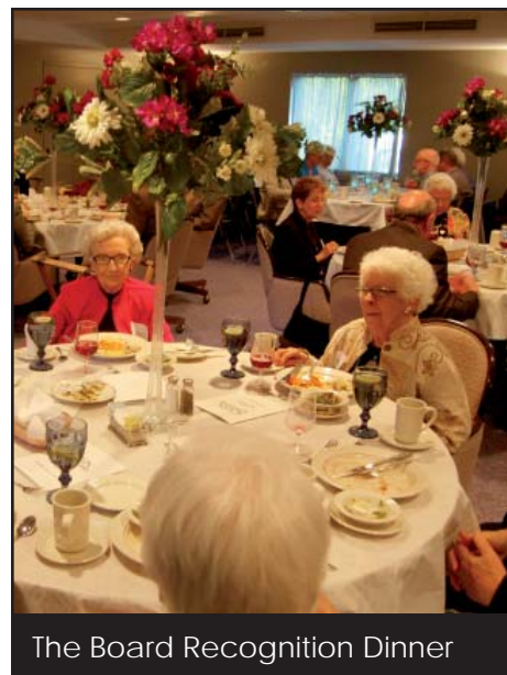
The Board Recognition Dinner

These Directors and Trustees will be featured in upcoming issues of the "Calvin Connection".