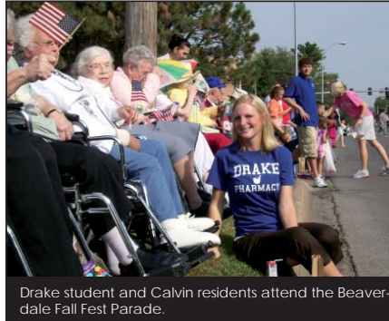
Drake student and Calvin residents attend the Beaverdale Fall Fest Parade.

Students also provide support to residents in a variety of activities and have annually provided the manpower to make it possible for many residents to attend the Beaverdale Fall Fest Parade. We are pleased to be a